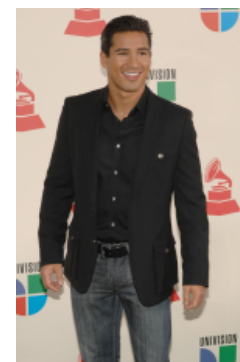
8th annual Latin Grammy Awards in Las Vegas

» Next in Entertainment: Khan called as witness in copyright case